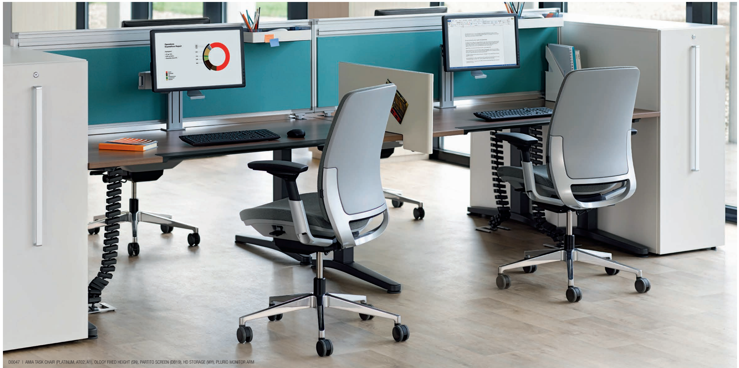
D0047 | AMIA TASK CHAIR (PLATINUM, AT02, A1), OLOGY FIXED HEIGHT (SN), PARTITO SCREEN (DB19), HD STORAGE (WY), PLURIO MONITOR ARM